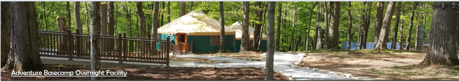
Adventure Basecamp Overnight Facility