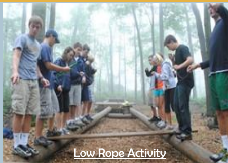
Low Rope Activity