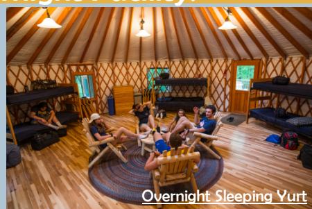
Overnight Sleeping Yurt