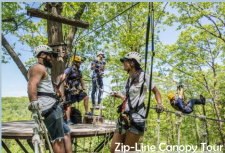
Zip-Line Canopy Tour